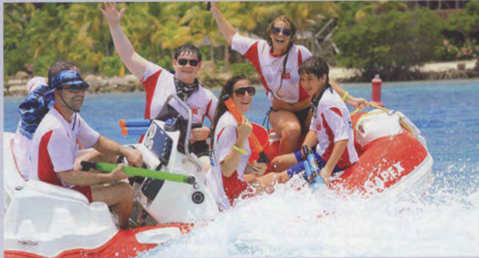
Dinghy Poker Run

destructive fish are caught in nets or by the use of spear guns. There will be trophies and prizes (including cash) awarded to the winners.”